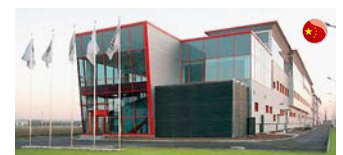
ARNOLD FASTENERS SHENYANG Shenyang China