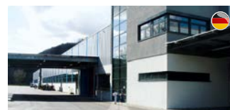
ARNOLD UMFORMTECHNIK Ernsbach Germany