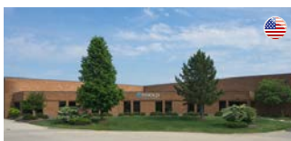
ARNOLD FASTENING SYSTEMS Rochester Hills USA