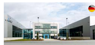
ARNOLD UMFORMTECHNIK Dörzbach Germany